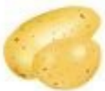
pommes de terre